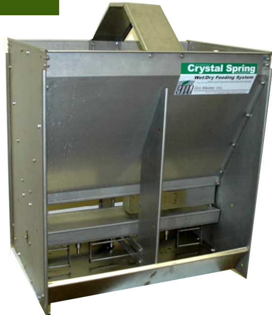
Feeder Insert to Lower Shelf